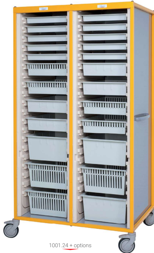
1001.24 + options