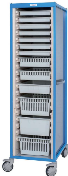
1001.23 + options