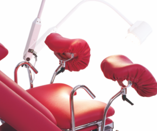
Examination light for mounting on the rail of the gyn table.