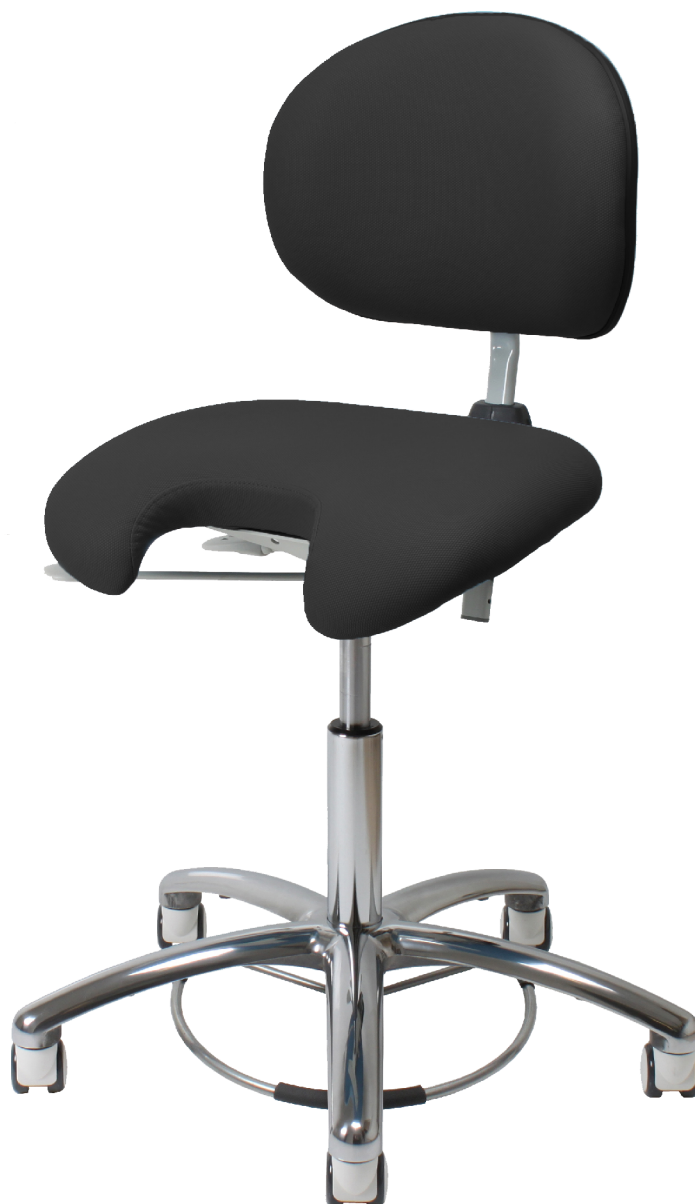
Model shown with foot control. Available also with hand control.

Alternative height hand control (39-54/50-70/60-86 cm), black antistatic artificial leather, alternative castors