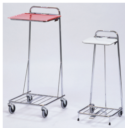
071-3023 och 070-1002