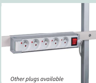
5 sockets + switch Ref. 1101.50