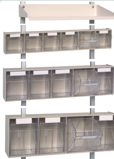
Shelf for bridge Ref. 1600.23