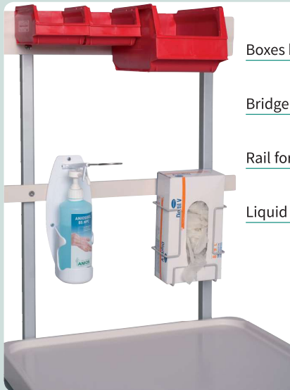
Boxes holder - Ref. 1600.24