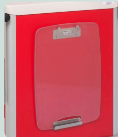
Cardiac board with handles - Ref. 1600.25