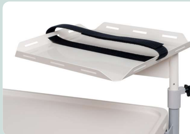
Swivel lateral defibrillator shelf - Ref. 1500.75