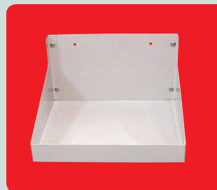
Holder for suction unit Ref. 1103.88