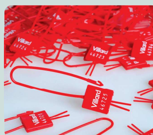
Red seals (qty 100) Ref. 1100.47