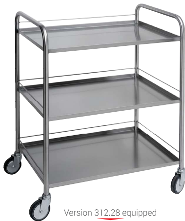
Version 312.28 equipped