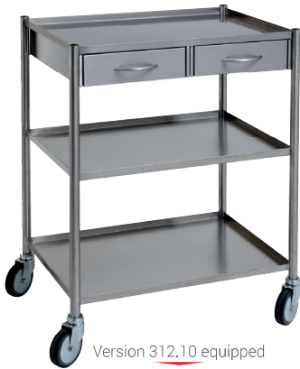
Version 312.10 equipped