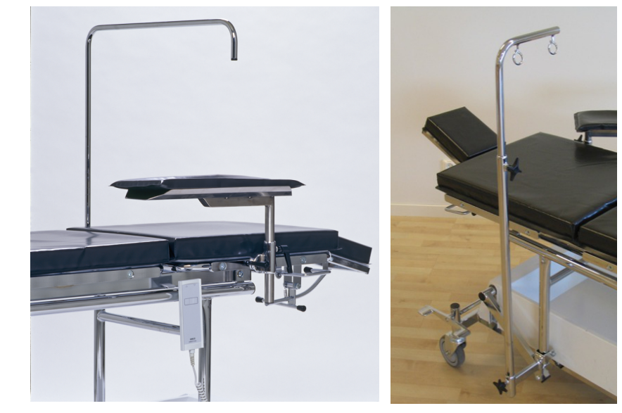
Anaestetic bow, armrest with pad plus IV stand (accessories)