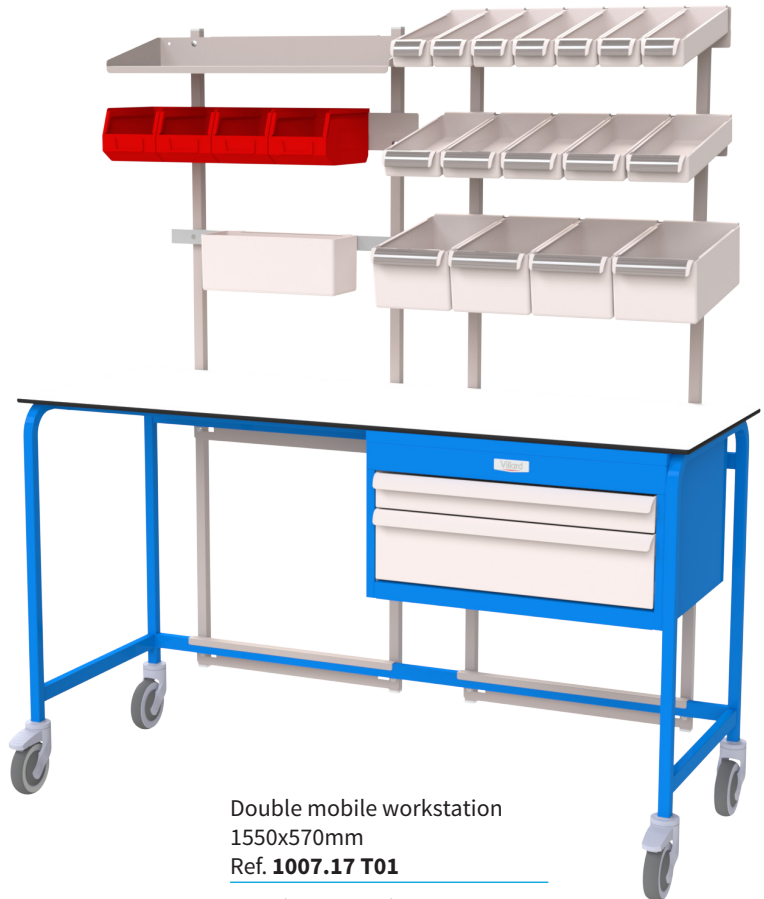
Double mobile workstation 1550x570mm Ref. 1007.17 T01