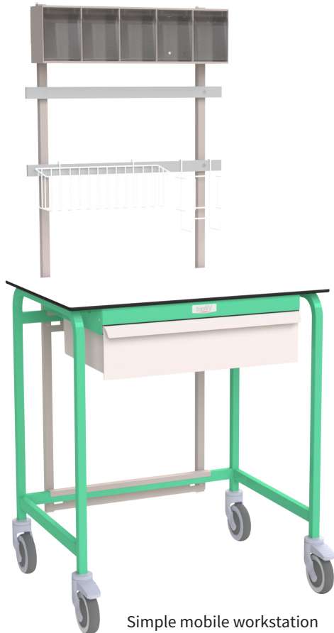
Simple mobile workstation 800x570mm Ref. 1007.16 T01