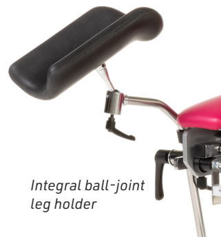
Integral ball-joint leg holder