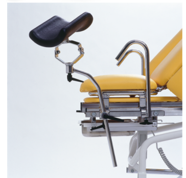
Integral leg holder