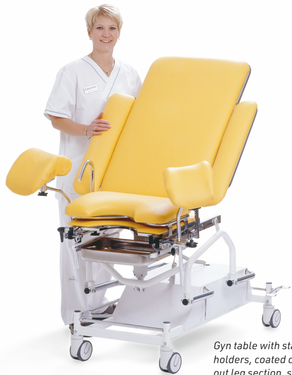
Gyn table with standard leg holders, coated chassis, pull-out leg section, side supports and patient handles.

Optional. Excellent when patients help themselves up and down from the chair. Chromium-plated steel, easily removable.