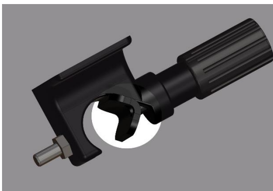
FAP3000153S (the aluminum piece circled)

To mount a pump, you need detail FAP3000153S, which is a protective aluminum plate to avoid damages to the stand tube.