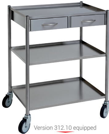
Version 312.10 equipped