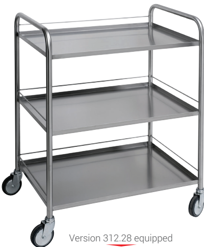
Version 312.28 equipped