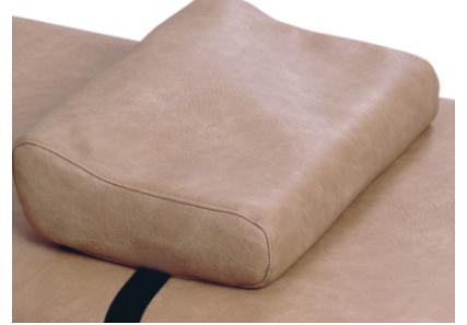
Neck cushion 010-0100