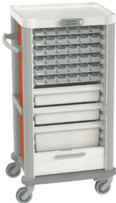
Ref. 1005.02 M01 Exactly equipped as per picture:

COMPACT MEDICATION CART - 154 PATIENTS DOUBLE - FULLY EQUIPPED WITH BRIDGE