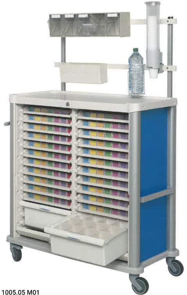
Ref. 1005.05 M01 Exactly equipped as per picture: