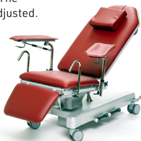
From original position to Trendelenburg by one pedal press.