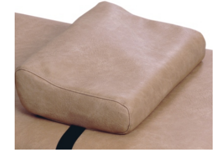
Neck cushion 010-0100

Length 200 cm Backrest length 77 cm Seat pad length 46 cm Leg section length 77 cm Width 70 cm Backrest angle +70° Trendelenburg angle -20° Weight ca 72 kg Max patient weight 160 kg