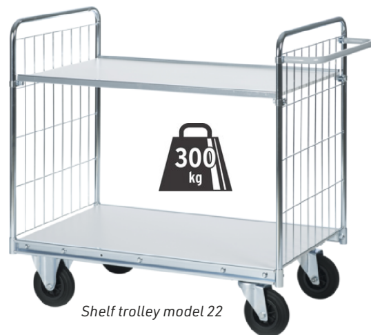
Shelf trolley model 22