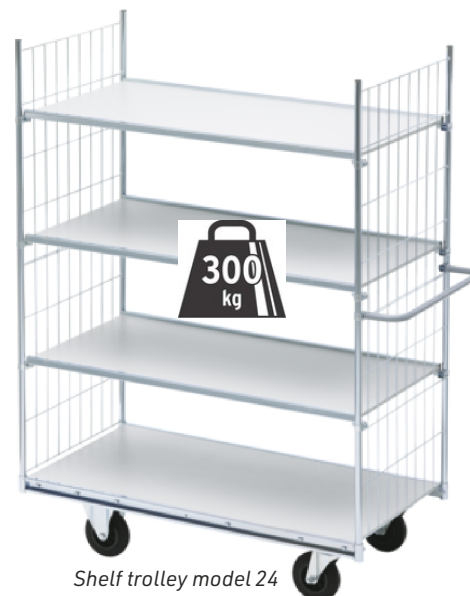
Shelf trolley model 24