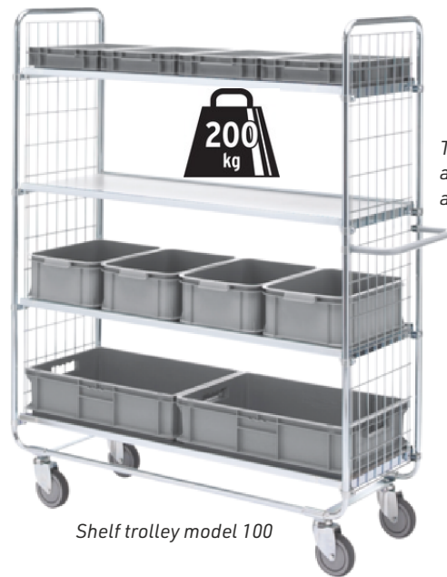
Shelf trolley model 100

No. 25240643: 990x650x1690 mm (LxBxH) No. 25242643: 1390x650x1690 mm (LxBxH) No. 25246643: 1790x650x1690 mm (LxBxH)